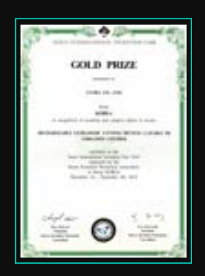
Gold prize-Seoul International Invention Fair