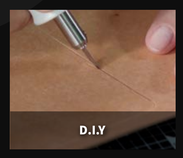
To do architecture modeling easily and safely