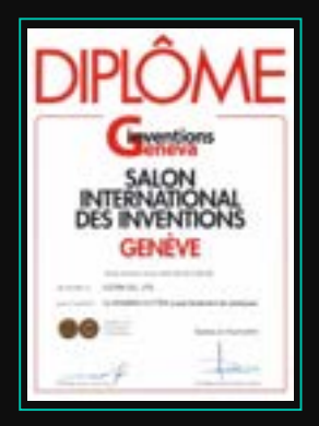
Gold prize-44th Salon International Des Inventions Geneve