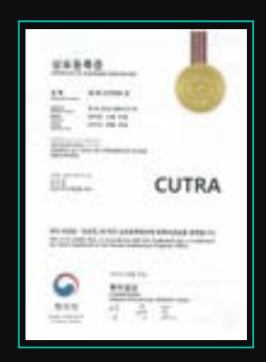
Certificate of Trademark Registration