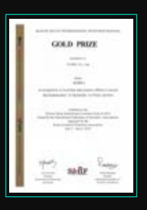
Gold prize-Silicon Valley International Invention Fastival