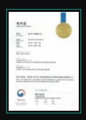
Certificate of patent