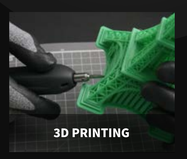
To remove supports from 3D prints smoothly and clearly