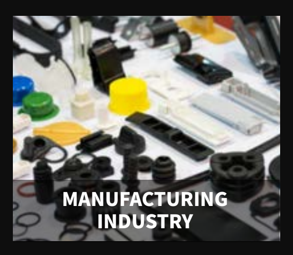
To post-process plastics quickly and easily