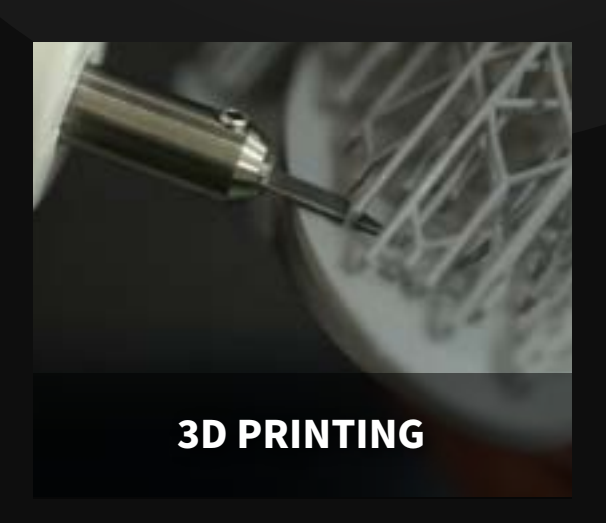
To remove supports from 3D prints smoothly and clearly