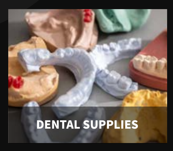
To trim dental plasters and resins delicately