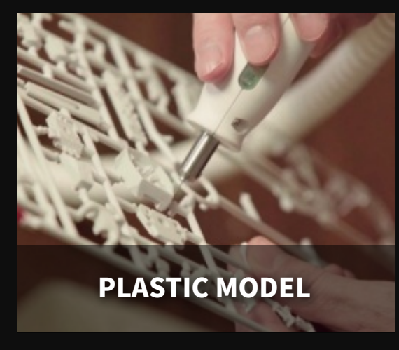
To assemble plastic figure kits sharply and finely